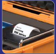
Built in printer